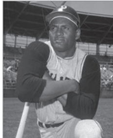
Clemente, Roberto Roberto Clemente, 1968.